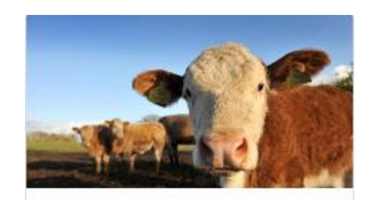
Livestock sector resilience plan