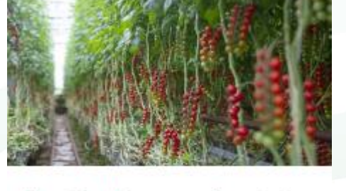
Horticulture and potato sector resilience plan

<u>Dairy sector</u> <u>resilience plan –</u> <u>NFUonline</u>