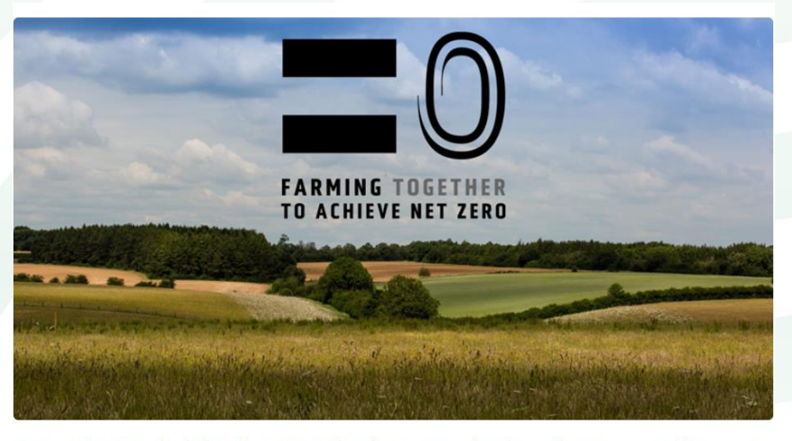
Countryside COP is back this 20–24 November, bringing together the rural community and businesses to showcase and inspire activity ahead of COP28 in UAE.