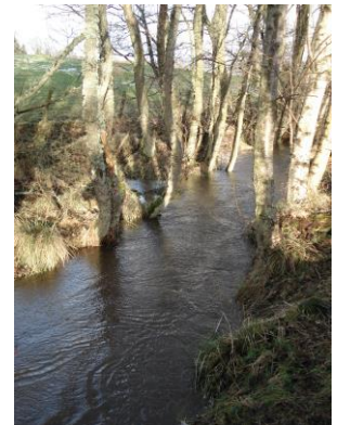
Wooded buffer strip in the Tarland catchment