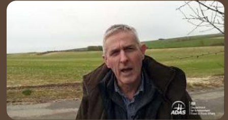
Introduction to 'Integrated Pest Management (IPM): Science and Practice' video series